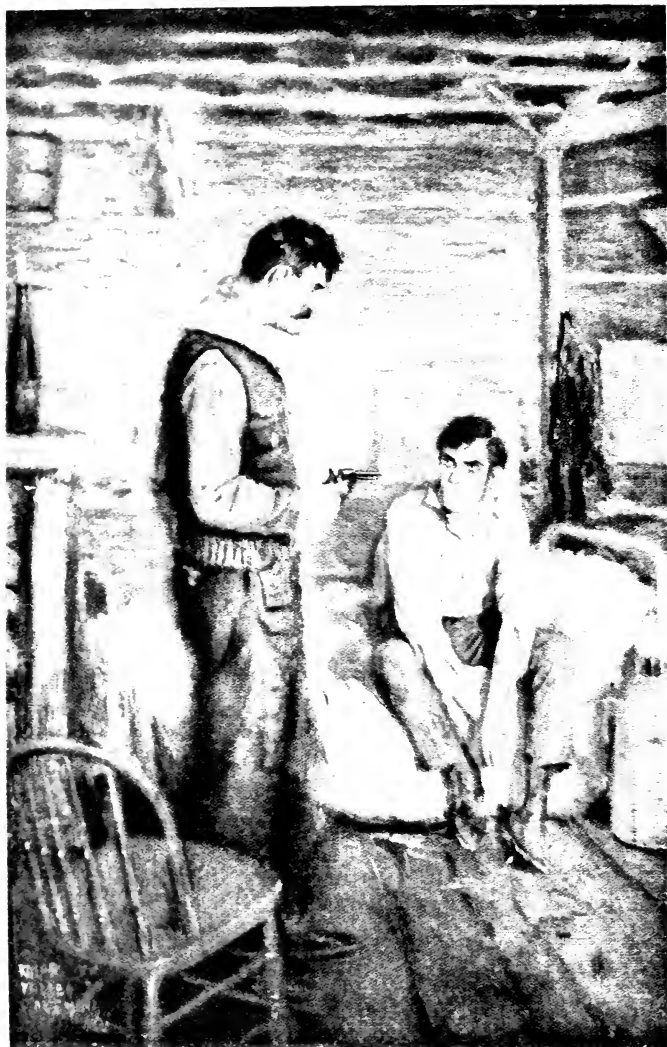
"His blazing black eyes stared into the gaze of Ross"